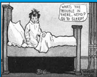
Little Nemo - Winsor Mc Cay - 1905

16:20 Sleep in comic strips - Geneviève Aubert (Brussels, BE)